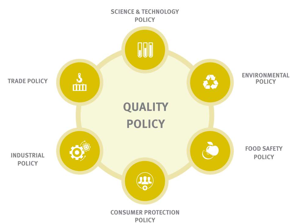
FIGURE 3: CROSS-CUTTING NATURE OF THE QP

as international commitments - see Figure 3. During the strategic planning stage, it is also important to begin thinking about the cost/benefit relationship of any changes to the QI that the policy will imply, and the resources that are likely to be required for its subsequent implementation.