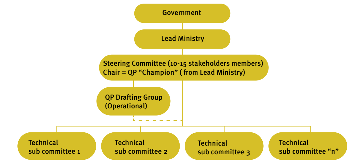
FIGURE 1: TYPICAL ORGANIZATION STRUCTURE FOR QP DEVELOPMENT PROCESS

Group of subject matter experts convened to support the development of specific functional elements (standardization, conformity assessment, metrology, etc.) and/or sector components of the QP (for example, food safety; agriculture; tourism). These technical subcommittees (which could also be in the form of task forces, working groups, networks etc.) typically report to the SC and provide inputs into the Drafting Group.